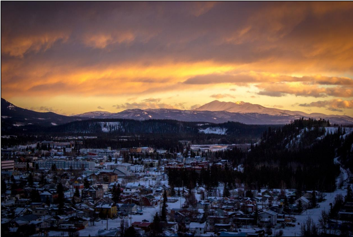
Sunset in Whitehorse