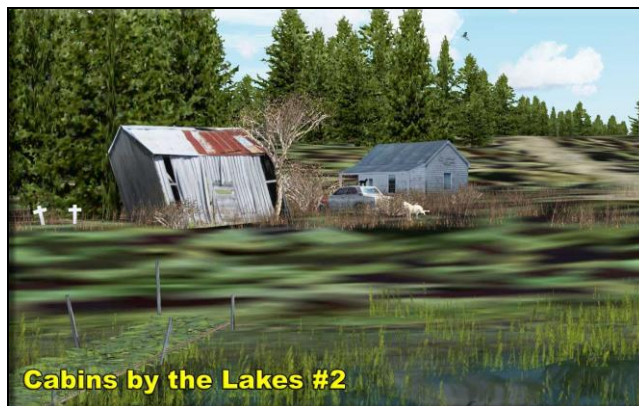
Cabins by the Lakes #2